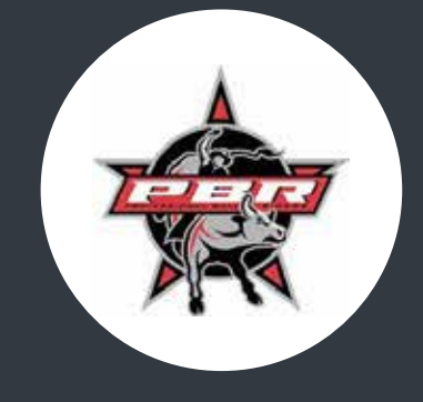
Rodeo starts at 6:45