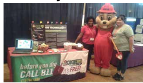
OU Day at the Capital