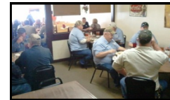
City of Hobart & Kiowa County March 14th