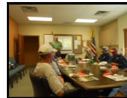
City of Noble March 13th