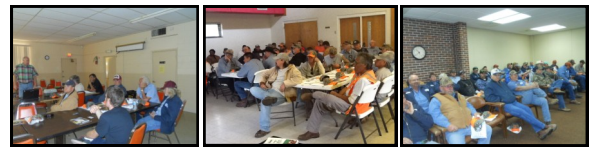
Maysville March 1st

For meeting locations, please check out our website www.callokie.com