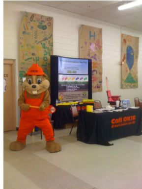
February 11th thru 13th Grove Home & Garden Show Grove, OK

The show, sponsored by the Grove Area Chamber of Commerce is the premier event for the chamber and featured hundreds of vendors from builders and building materials to businesses that offer home decorating and realtors .