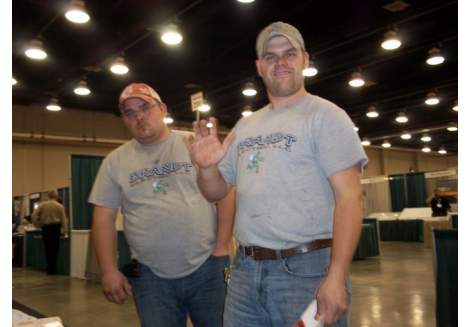
February 18th & 19th Locke Supply Trade Show Cox Convention Center OKC

The show, sponsored by the Grove Area Chamber of Commerce is the premier event for the chamber and featured hundreds of vendors from builders and building materials to businesses that offer home decorating and realtors .