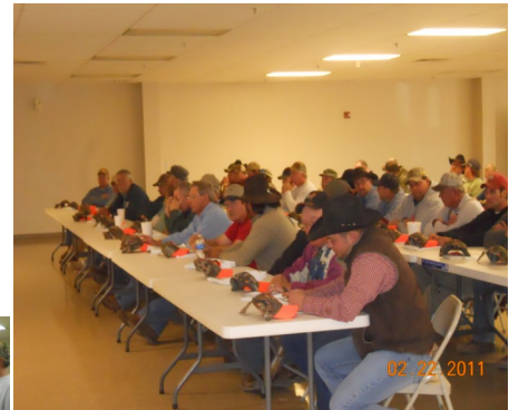
February 23rd Washita County Employee Adhoc Cordell, OK